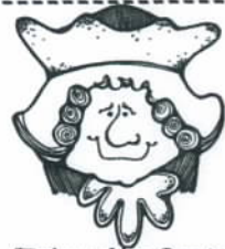
"Father of his Country"